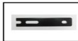
4. BRACKET FOR TX WRD